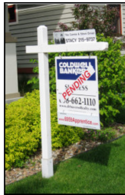
I sold my home in the Madison area quickly, which was a tremendous blessing.

After ten terrific years with InterVarsity, I've accepted a new ministry assignment with the School of Business and Economics at Seattle Pacific University (SPU), where I'll direct the Center for Integrity in Business. The "off-ramp" with InterVarsity, as I describe in the enclosed letter, will be slow and steady, so your ongoing prayers and financial investment will be greatly appreciated and needed.